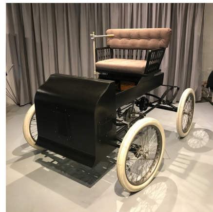
1897 Fossmobile tribute replica