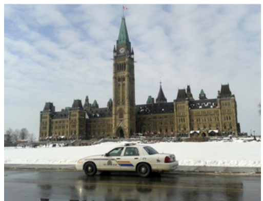
Our most popular post of 2022 was on Canadian Ford Crown Victorias.