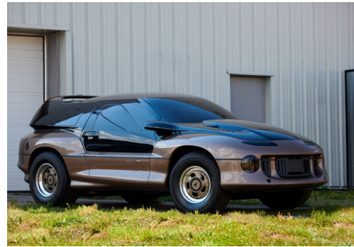
1987 Magna Torrero