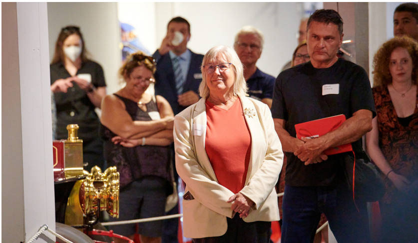
Museum supporters attending the opening of Wires to Wheels on September 8, 2023.

The Canadian Automotive Museum's incorporation number is 106843121 RR0001.