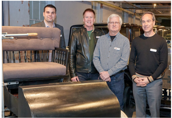
Board member with the 1897 Fossmobile.