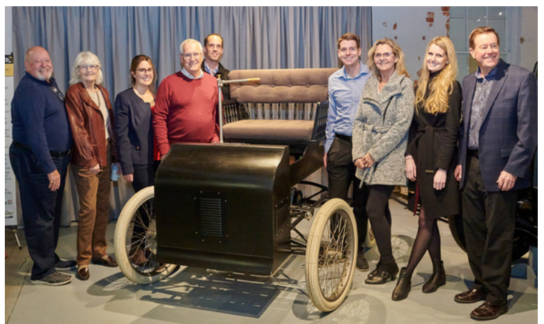
The Fossmobile family at December Fossmobile reception.

CAM hosted three members' receptions in 2022; the Curator's Reception on April 8, Wires to Wheels exhibition opening reception on September 8, and the Fossmobile Reception on December 2.