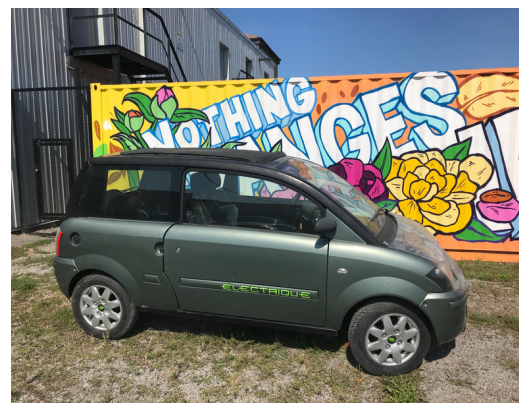
2008 ZENN electric