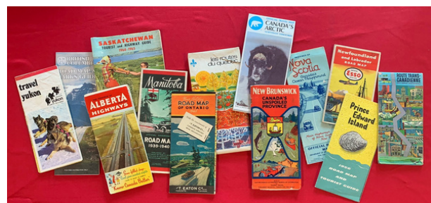
Goforth map collection