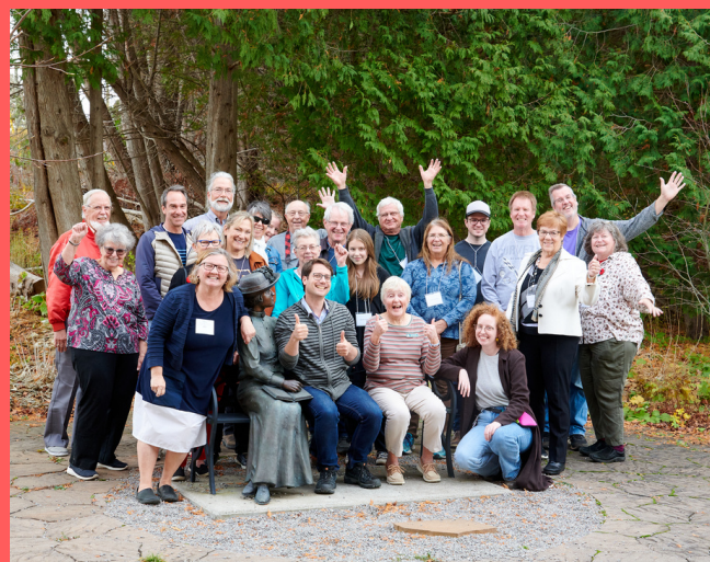
The second annual Park & Picnic went to Leaskdale National Historic Site on November 5, 2022.