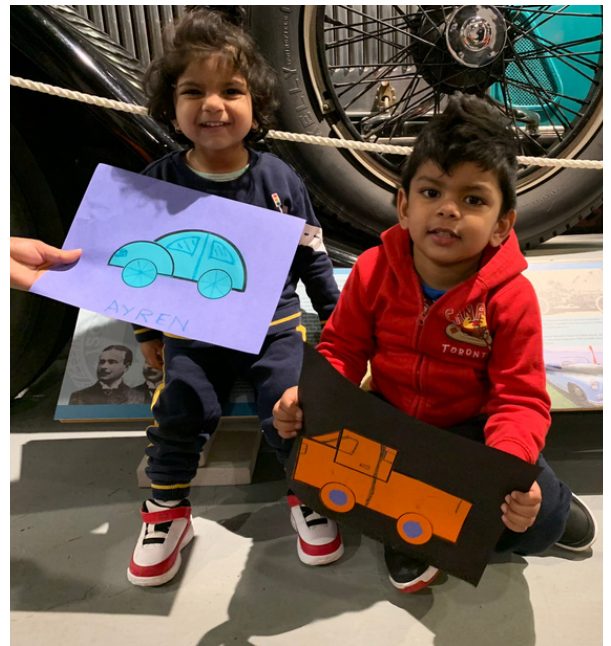
Young visitors enjoying museum activities.