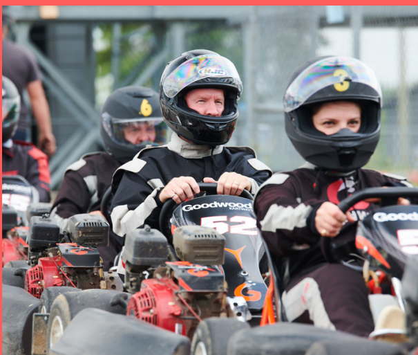
Museum members suit up to drive go karts during Rally Durham fundraising event on June 12, 2022.

The museum's two signature members' events are the full-day Rally Durham and half-day Park & Picnic. Members are encouraged to bring their classic cars out for a drive to fun destinations around Durham Region while raising funds for the museum. These events raised more than $5,000 to support the museum's programs.