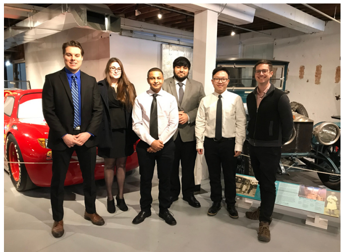
Ontario Tech University capstone students .

The museum hosted a Capstone Project from Ontario Tech University and a Durham College LIT student in 2019. Four current students and recent graduates were employed through Young Canada Works.