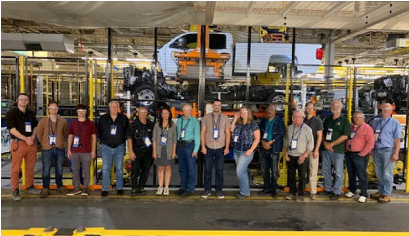
Museum members tour the GM Oshawa Assembly Plant, September 2019

The Canadian Automotive Museum's incorporation number is 106843121 RR0001.