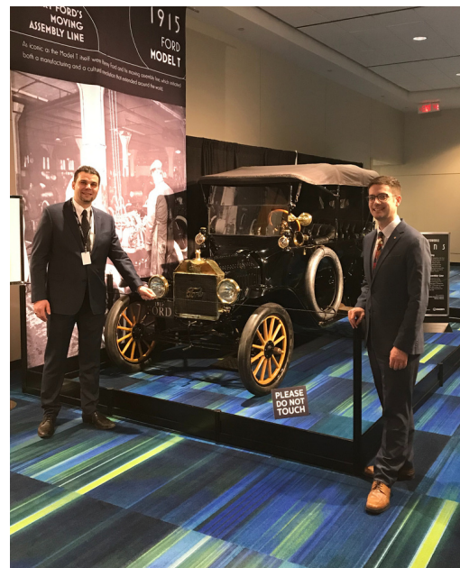
The 1915 Ford Model T at the 2019 Canadian International Auto Show in Toronto.