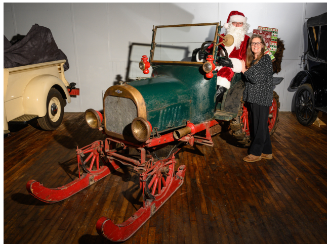
Santa Claus made a special appearance in 2019 as part of a photo shoot.